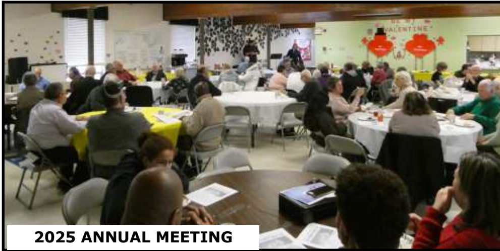
2025 ANNUAL MEETING